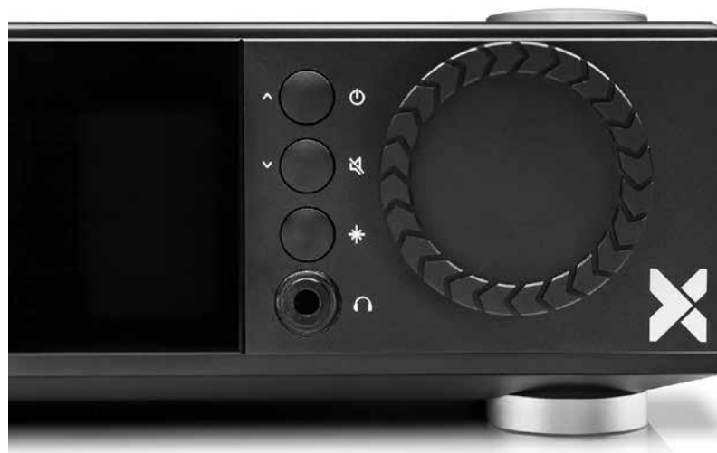
Few control buttons and a large knob for volume and input selection make the Forté 1 easy to operate.

Even after 40 years, a milestone of pop music, convincing in every respect.