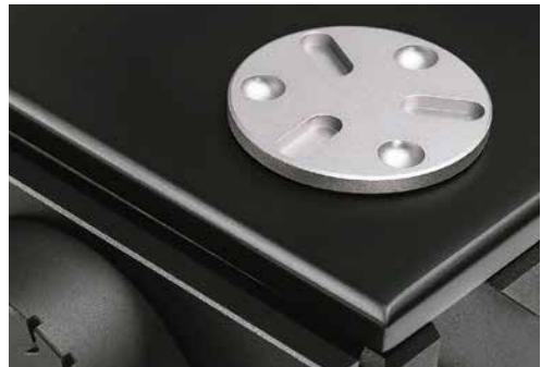
The case is made of a mix of natural materials and elaborately crafted. The Axxess products can be recognized by the X on the side.

While we had already spent a few enjoyable hours in various listening setups by now, combining the amp with the Børresen